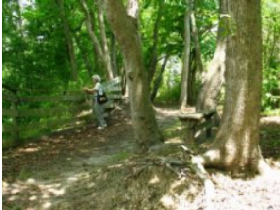
Sybil on the Trail

We carried the cooler to a table close to the canal and saw a sailboat docked at the small quay. We put our cooler on the table and ate the food we had brought. We sat, enjoying the cool air and watched the insects that buzzed past. Several dogs on leashes sniffed around, inspecting new places.